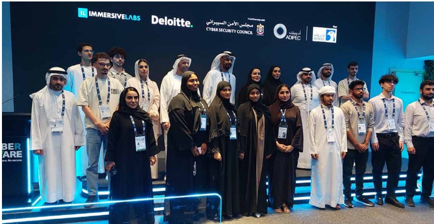
A group of ADPoly ISET students participated in the "Cyber Battles -Capture the Flag" Competition at ADIPEC.

Abu Dhabi Polytechnic (AD Poly) participated in the Abu Dhabi International Petroleum Exhibition and Conference (ADIPEC), held from 4 th to 7 th November 2024, highlighting their commitment to innovation and sustainability.