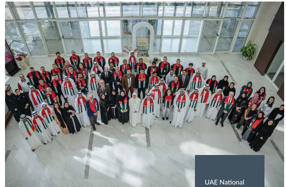
UAE National Day on 28 November 2024

This was followed by a fun and interactive quiz game, testing everyone's knowledge about the UAE's history, culture, and landmarks. The celebration concluded with a delicious lunch, providing an opportunity for staff to connect, reflect, and enjoy the spirit of unity and patriotism.